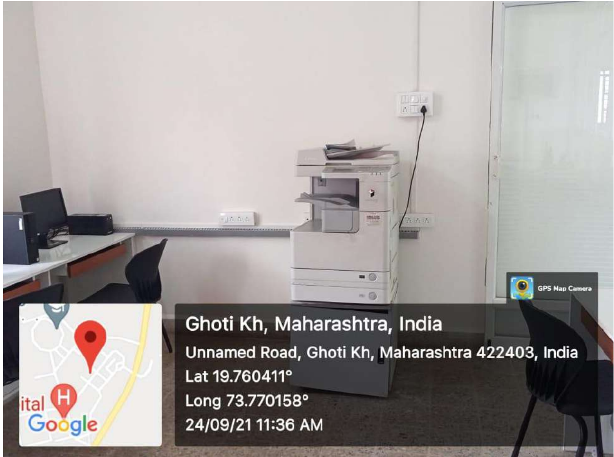
Photo Copy Facilities

Nandihills, Dhamangaon-Ghoti, Tal. Igatpuri, Nashik-422403 Ph. (02553) 282341 Email : principal.ayurved@smbt.edu.in | smbtayurved@gmail.com | www.smbt.edu.in